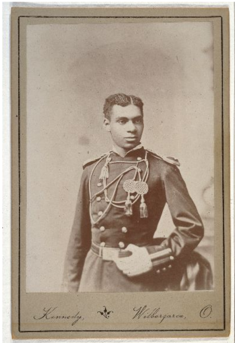
Henry O. Flipper, the first Black officer to lead soldiers of the 10th Cavalry.

You can also drop into the Hub and scan on another day. All you need to participate in this project is a National Archives research card.